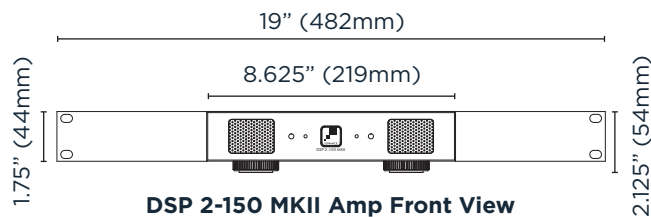
DSP 2-150 MKII Amp Front View